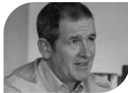
MANAGING DIRECTOR PEQUOD ASSOCIATED LTD