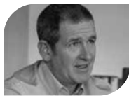
MANAGING DIRECTOR PEQUOD ASSOCIATED LTD